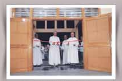
Blessing of Academic Block II